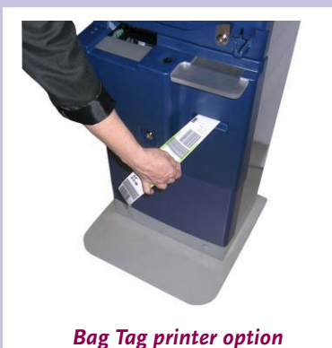
Bag Tag printer option