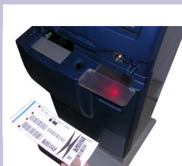
Easily viewable barcode scanner