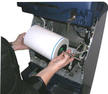
... and boarding pass.