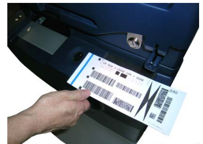
1D/2D barcode reading