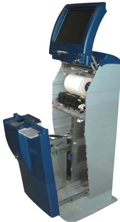
Full access to all internal components for quick, cost-effective service