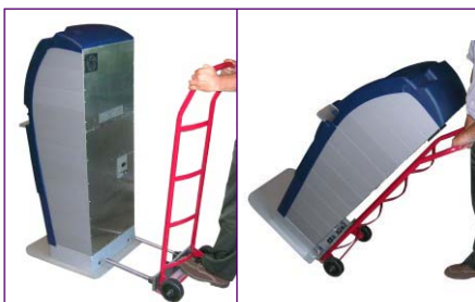
Easily movable with a special trolley