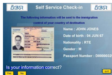
Full page passport reader