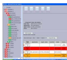
KIOSKS MONITORING SYSTEM