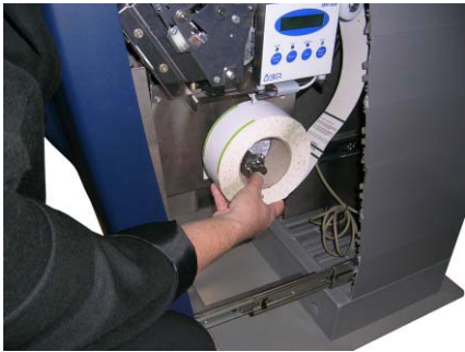
Easy roll change for bag tag...